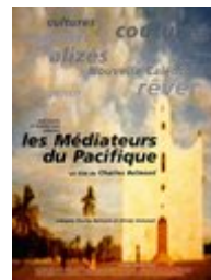
Les Médiateurs du Pacifique