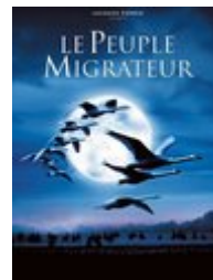
Le Peuple migrateur