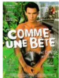
Comme une bête