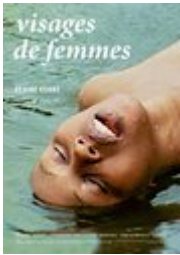
Visages de femmes