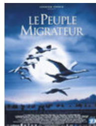
Le Peuple migrateur