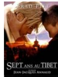
Sept ans au Tibet