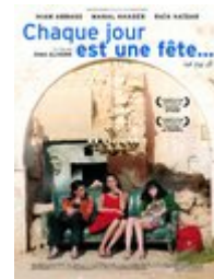
Chaque jour est une fête