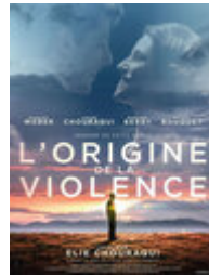
L'Origine de la violence