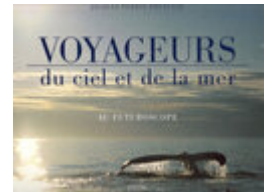
Voyageurs du ciel et de la mer