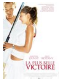
La Plus belle victoire