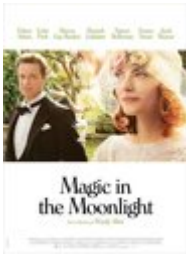
Magic in the Moonlight