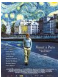
Minuit à Paris