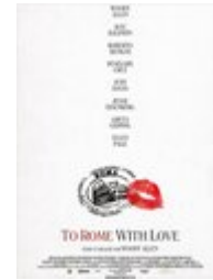
To Rome with Love