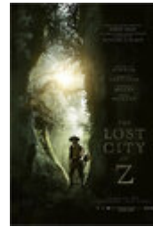
The Lost City of Z