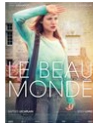
Le Beau monde