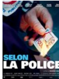
Selon la police