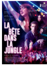
La Bête dans la jungle