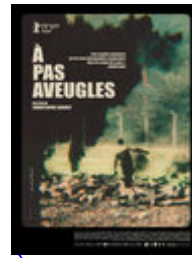
À pas aveugles