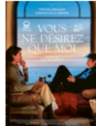
Vous ne désirez que moi