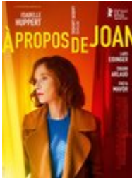
À propos de Joan