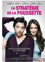
La Stratégie de la poussette