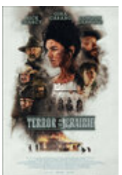
Terror on the Prairie