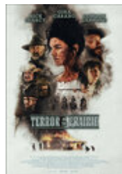
Terror on the Prairie (English version)