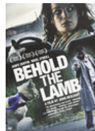
Behold the Lamb