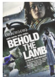
Behold the Lamb