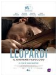
Leopardi - Il giovane favoloso