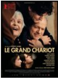
Le Grand Chariot