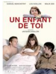
Un enfant de toi