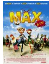
Max & Co.