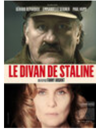
Le Divan de Staline