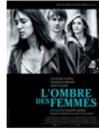
L'Ombre des femmes