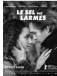
Le Sel des larmes