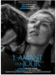
L'Amant d'un jour