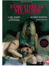
For This is my Body