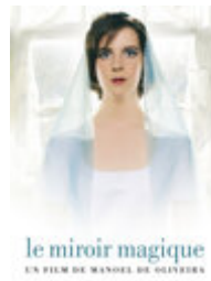
Le Miroir magique