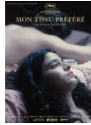
Mon tissu préféré