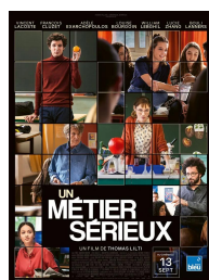
Un métier sérieux