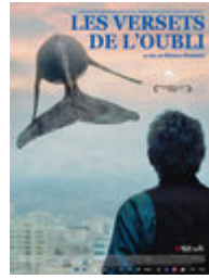
Les Versets de l'oubli