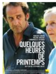
Quelques heures de printemps