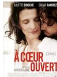
A cœur ouvert